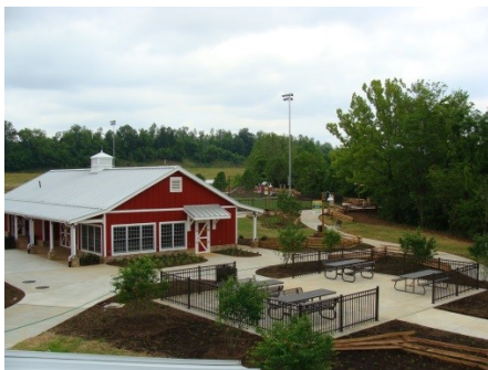
Meeting Room & Picnic Area