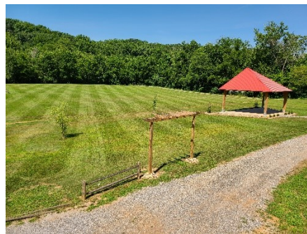
Amphitheatre and Festival Grounds