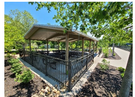
Covered Outdoor Meeting Space